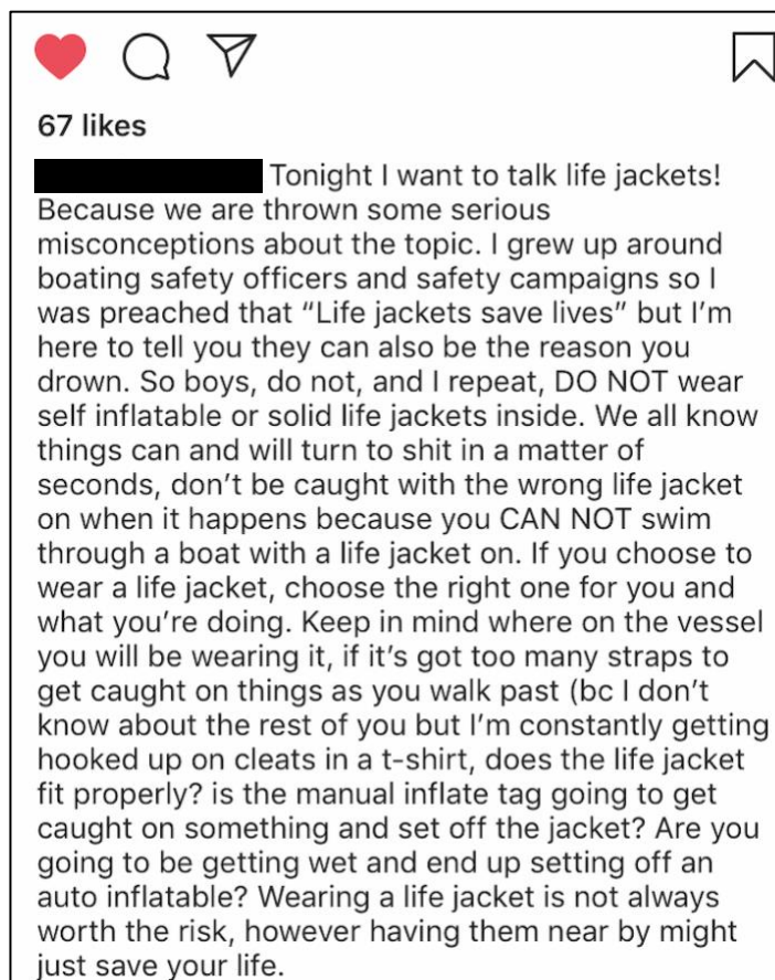
Figure 3: Fisher Instagram post on choosing to wear a PFD

What becomes evident is that for fishers, the choice of wearing a PFD is not a simple binary one; yes or no, nor is the management of any risk in the context of any individual operation based on the availability of resources, vessel layout, work environment, fishing method, years of experience etc.